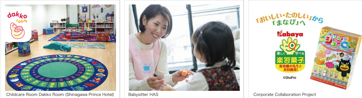
Childcare Room Dakko Room (Shinagawa Prince Hotel)