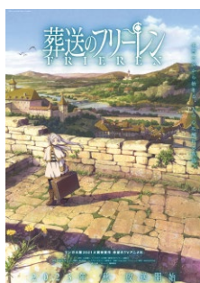
©Kanehito Yamada, Tsukasa Abe / Shogakukan / "Frieren" Project