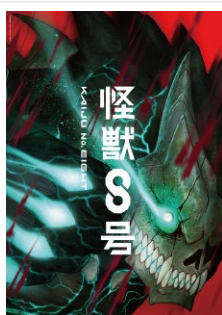
© JAKDF 3rd Division / Naoya Matsumoto/SHUEISHA