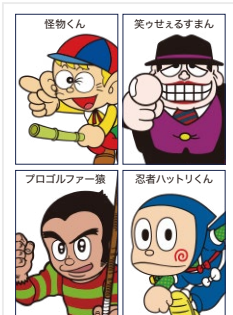
©Fujiko®, SHIN-EI, SHOGAKUKAN / ©Fujiko®, SHIN-EI, CHUOKORON-SHINSHA