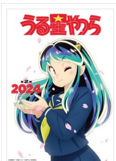
©Rumiko Takahashi, Shogakukan / "URUSEIYATSURA" production committee